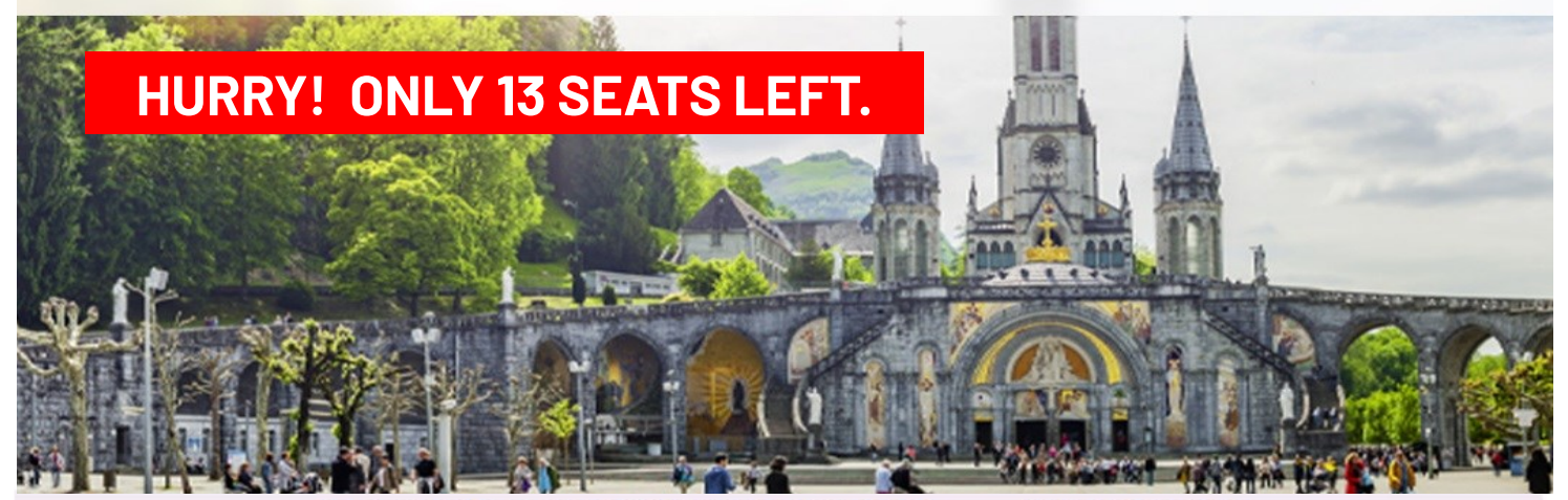
Book now and save $350: Double $3,999*

May 18 — May 27, 2025 • 10 Days • 15 Meals